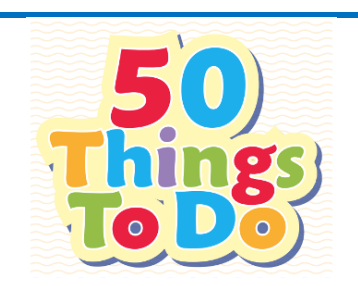
50 Things Activities