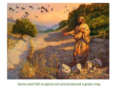
seed lell on good soil and produced a great crop.